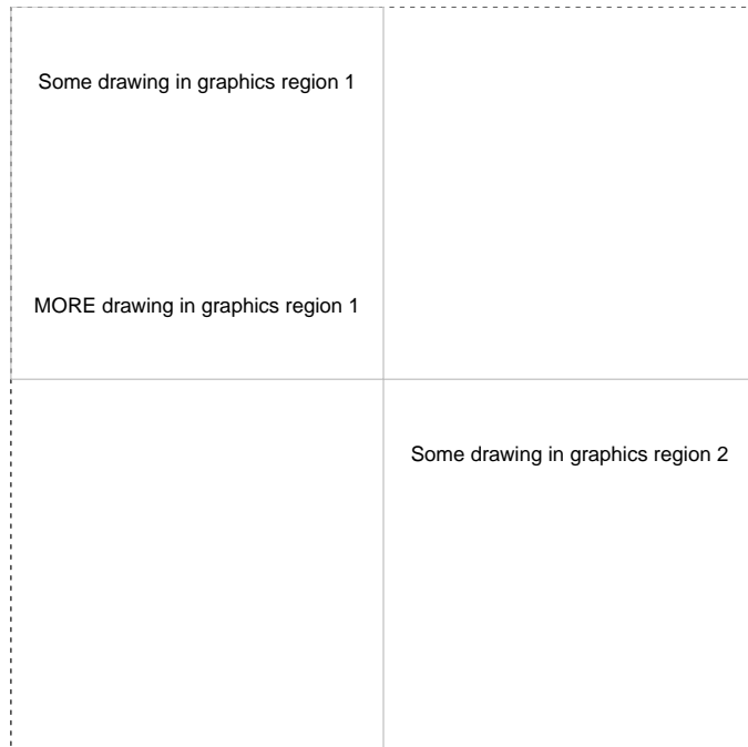
Figure 2: Defining and drawing in multiple graphics regions.